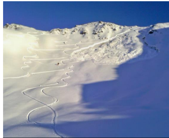
Hatcher Pass

What seems to be an emerging pattern is winter's new mood, kind of lazy to get started and staying out later. Warm temperatures persisted through what is normally a very cold autumn. November and April both averaged 29°F, with the rest of "winter" about the same. Bunny boots, which are classically Alaskan and mandatory issue in most winters, stayed in the shed this season.