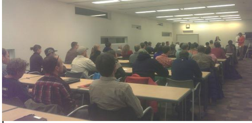
2014 Snow Safety Summit

Beginning in 2008, the Alaska Avalanche Information Center (AAIC) serves as the statewide forum to support Alaskan avalanche information and education. On November 6, 2014 AAIC hosted the seventh annual statewide summit on Snow Safety.