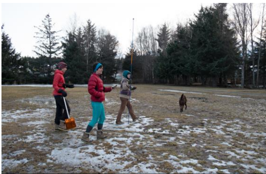
Haines Training: Photo by Jeff Moskowitz

HAINES: Natural avalanche activity this winter favored a high proportion of small (D2-ish) slides, and a distinct lack of large slides with very little debris in lower runout zones.